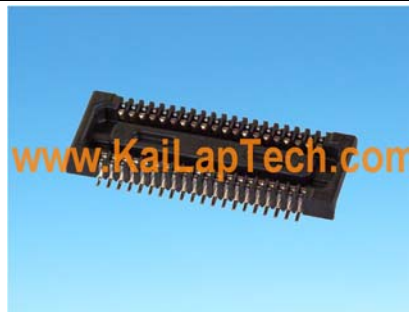
Gegenstecker Teile-Nr. DF30FC-40DS-0.4V

Gegenstecker auf der Hauptplatine. Separat erhältlich.